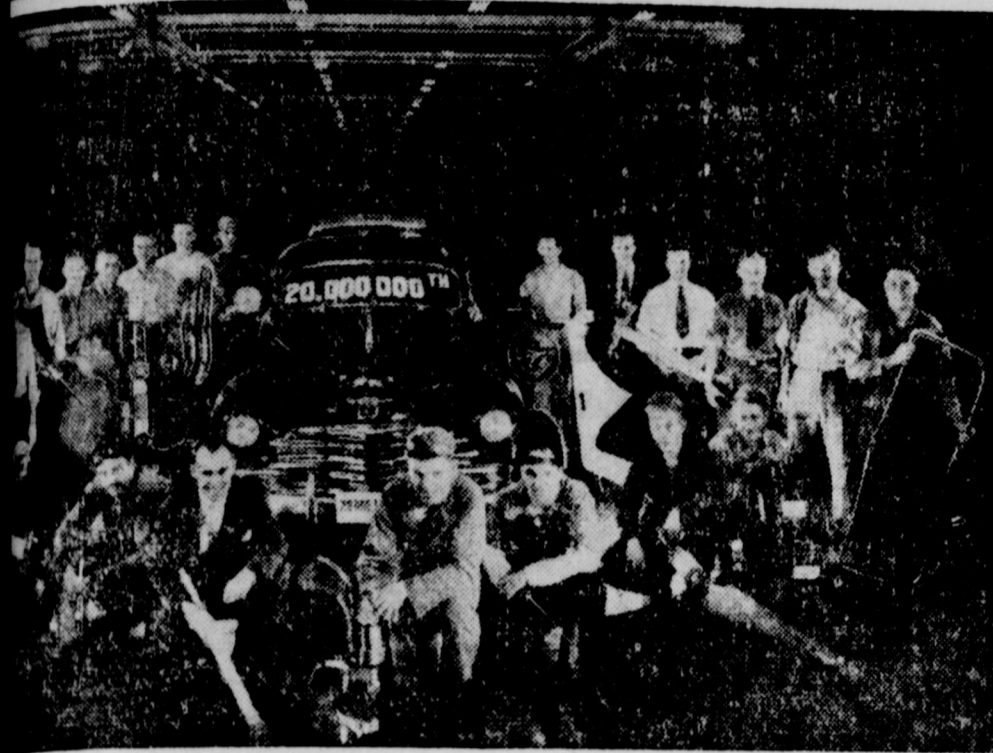
Men whose combined crafts and skills are... his designs and blueprints, to the polisher with his buffing tool...