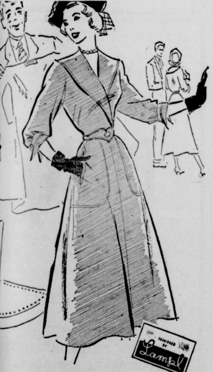
Lampel serves you right... with this one piece rayon gabardine... long draped shawl collar... two large saddle pockets and self belt. In chic colors. Sizes 10 to 20