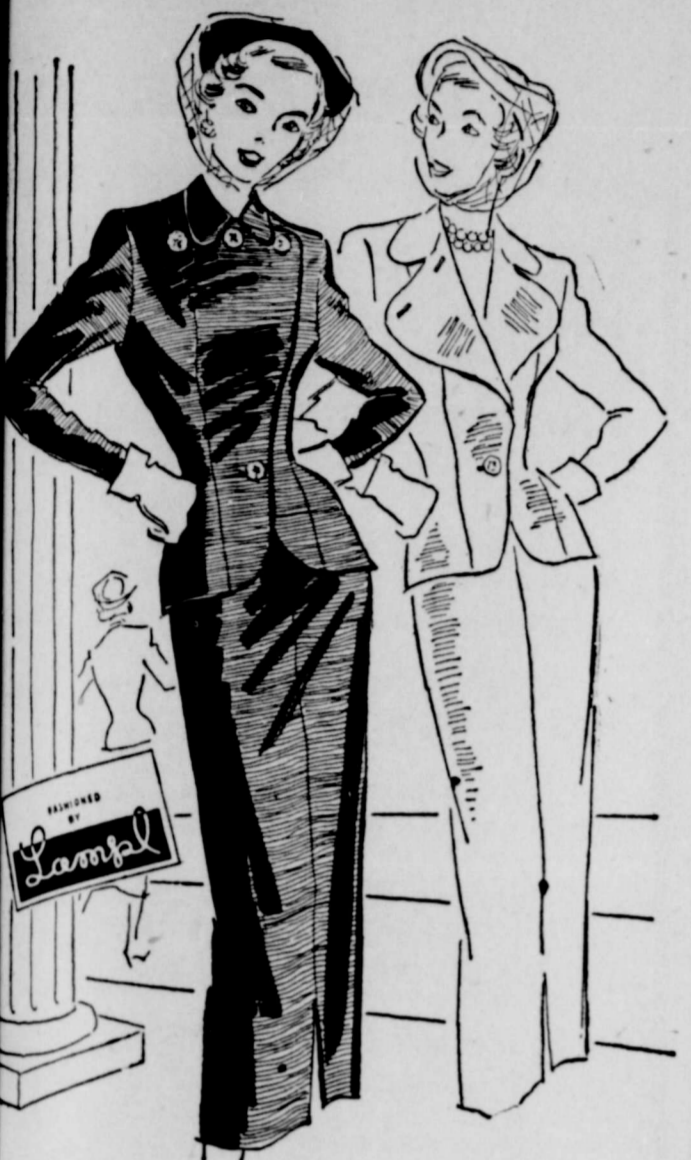
Lampel doubles your wardrobe with this two piece dress of Stonecutter Faille. Can be worn with lapels turned back. In trim colors. Sizes 10 to 20