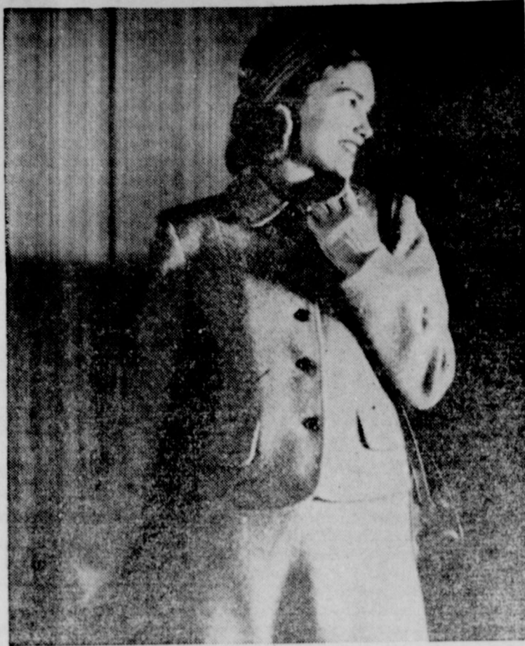
Today's teen agers insist that the new fashions make sense, and the new clothes are making a hit because they are not corny. Shown above as pictured in the August issue of Good Housekeeping magazine is "the easiest tweed suit in the world," cut for fast traveling between soda fountain and study hall.