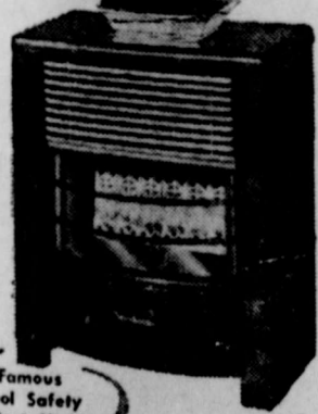
Famous Cool Safety Cabinet Heater

BUY AHEAD and you'll BE AHEAD Get your Dearborn NOW!