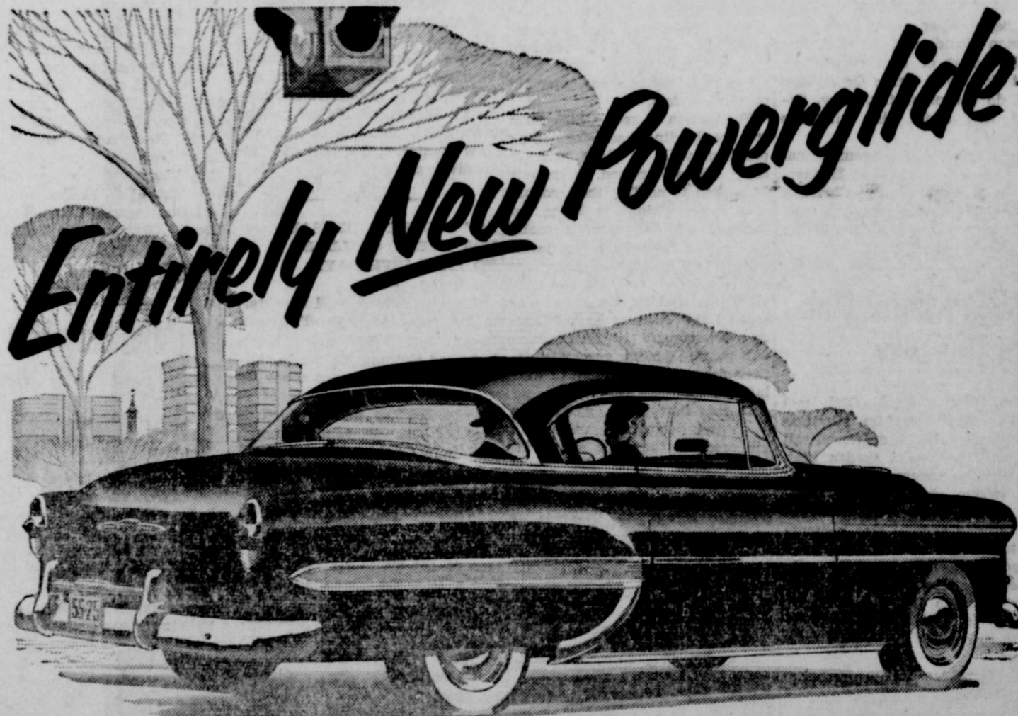
The striking new Bel Air Sport Coupe, one of 16 beautiful models in 3 great new series.