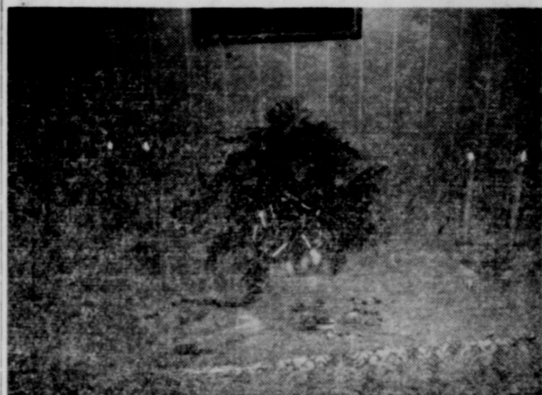
Picture of table decoration evening of organization, showing charter signed and pledge pins.