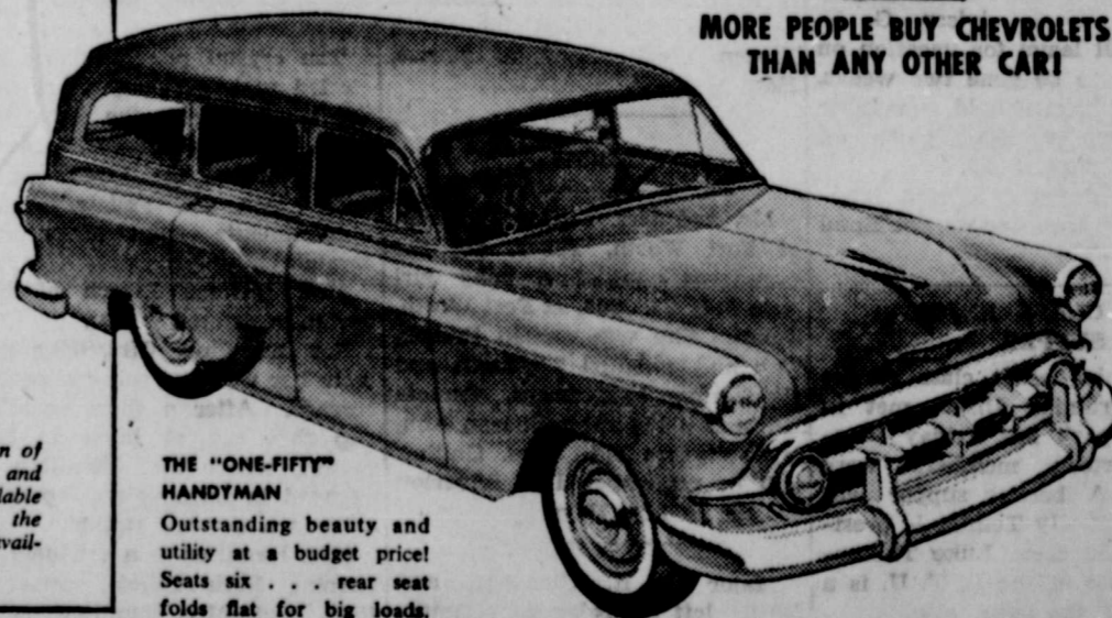
THE "ONE-FIFTY" HANDYMAN

MORE PEOPLE BUY CHEVROLETS THAN ANY OTHER CARS!