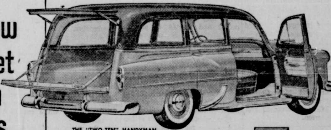
THE "TWO-TEN" HANDYMAN

Beautiful, simulated wood-grain trim. Plenty of room for 8 passengers. Center and rear seats can be removed for extra carrying space.