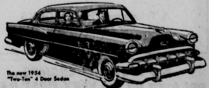
The new 1954 "Two-Ten" 4 Door Sedan

Famed Knee-Action Ride —Chevrolet gives you the only Utilized