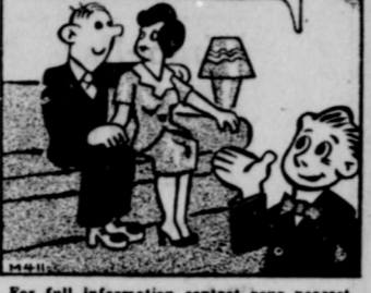
For full information contact your nearest VETERANS ADMINISTRATION office

VETERANS WITH 61 MORTGAGES ON THEIR HOMES CAN MAKE MONTHLY PAYMENTS TO LENDERS OR PAY OFF THE ENTIRE LOAN AT ANY TIME WITHOUT PENALTY