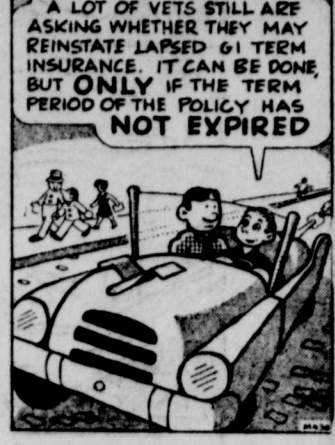
For full information contact your nearest VETERANS ADMINISTRATION office