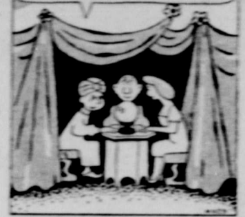
For full information contact your nearest VETERANS ADMINISTRATION office.

POST-KOREA VETERANS WHO HAVE TAKEN OUT LIFE INSURANCE SHOULD MAKE SURE THEY HAVE NOTIFIED VA OF THE BENEFICIARIES TO WHOM THE INSURANCE SHOULD BE PAID.