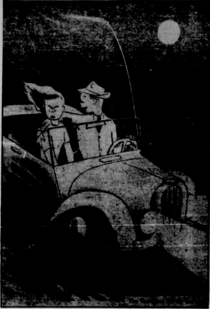
"What's the matter, Chick? Don't you know you're with a very experienced one-arm driver?!"

posite from the heat of the exhaust pipe.