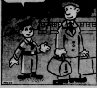
For full information contact your nearest VETERANS ADMINISTRATION office.

MEMBERS OF THE ARMY, NAVY AND AIR ROTC CALLED TO ACTIVE DUTY FOR 14 DAYS OR MORE ARE COVERED BY FREE GI INDEMNITY AGAINST DEATH IN SERVICE UNDER A NEW LAW.