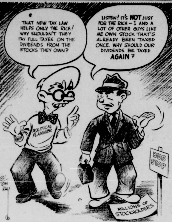
A Neat Rebuttal