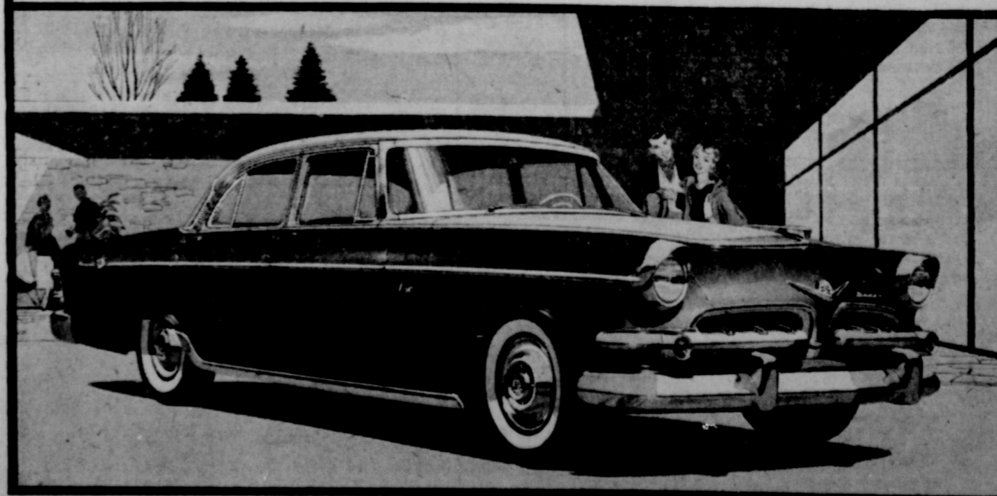
New Dodge Custom Royal 4-Door Sedan—Flair-Fashioned for the Future.