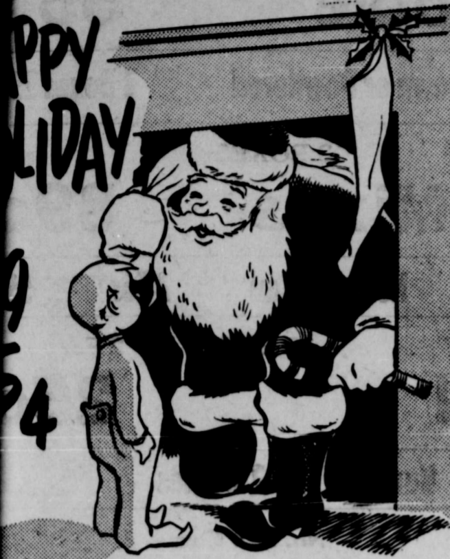
And the season's greetings.