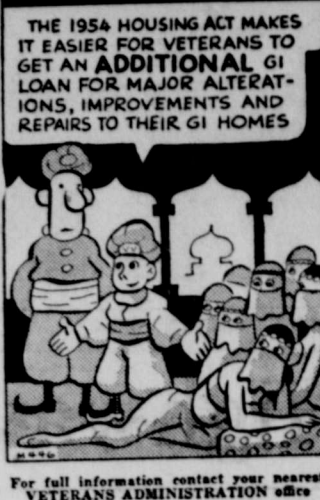
For full information contact your nearest VETERANS ADMINISTRATION office.