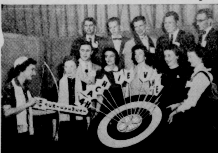
FOR the 35th consecutive year the nation's top 4-H youth are setting their sights high to reach their goal and the National 4-H Club Congress in Chicago, Nov. 25-29, where they will be honored and rewarded for outstanding accomplishment.

representing over two million 4-H Club members from 48 states, Alaska, Hawaii, and Puerto will attend the Congress. In addition to an all-expense trip, these state, sectional and national win-ners will receive other rewards climaxing several years of diligent 4-H project work.