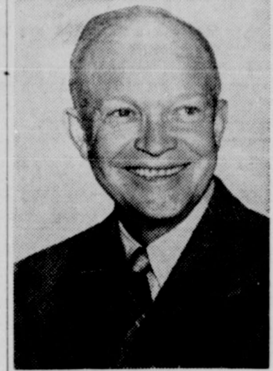
DWIGHT D. EISENHOWER