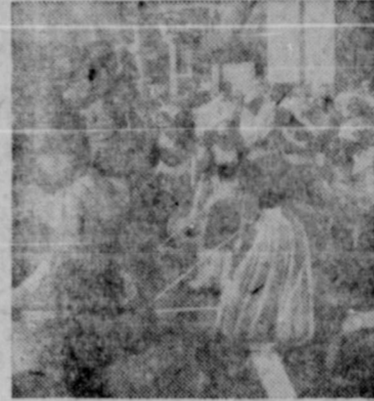
John Deere Day guests will delight in the story of the huge tulip farms in Holland, Michigan, which will be included in the film, "Oddities in Farming," one of the six films which make up the program. Featured will be the entertainment film, "Heavens to Betsy."