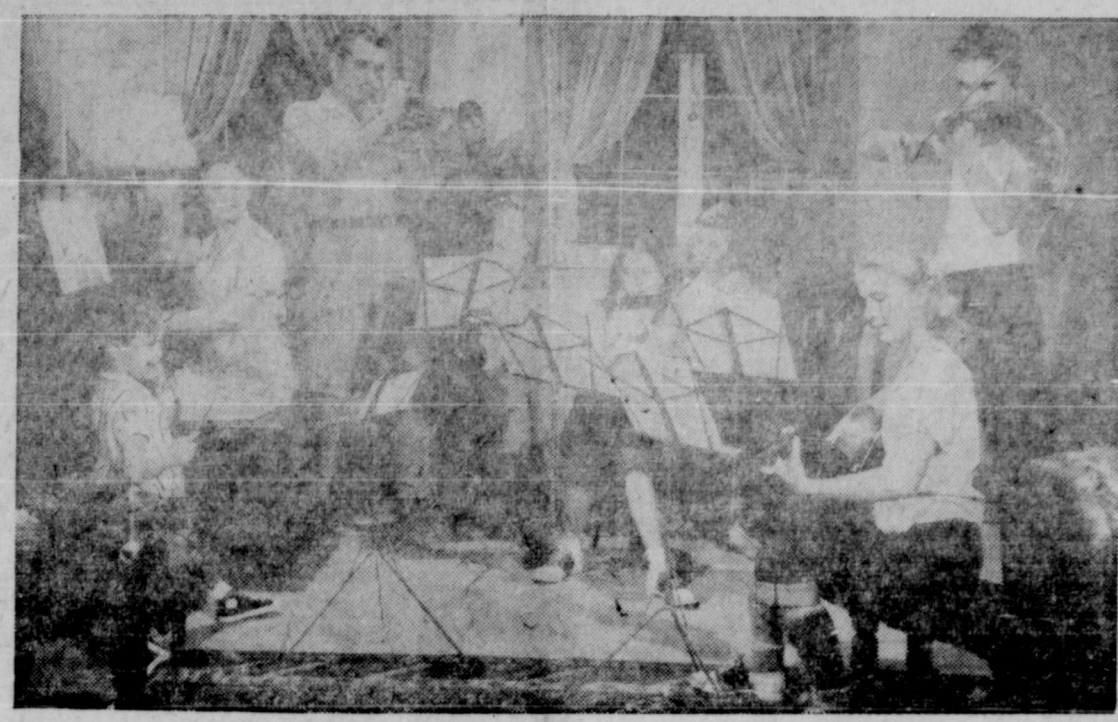
This is a typical scene from the John Deere Day feature picture, "Heavens to Betsy." It is the story of rural family life and the comedy, turmoil, and excitement that ensues when "Mom" is nominated for the title "Mother of the Year. To be at the Palace Theatre Saturday Afternoon, January 19, 1957.