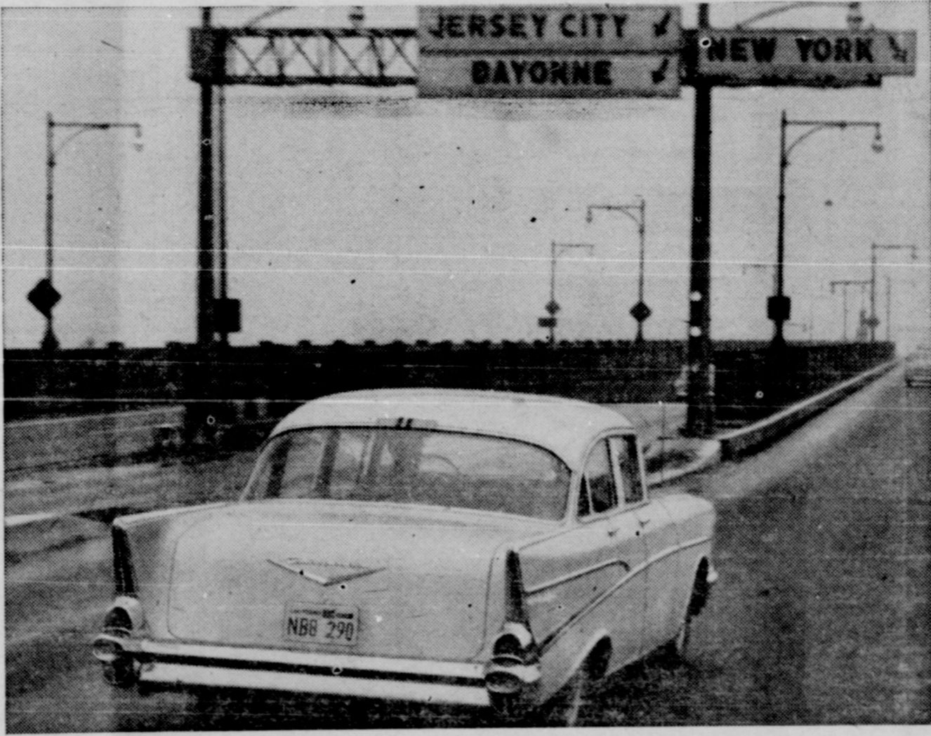
AIR CONDITIONING—TEMPERATURES MADE TO ORDER—AT NEW LOW COST. GET A DEMONSTRATION!

NUMBER ONE IN CROSS-COUNTRY ECONOMY TEST -CHEVROLET!