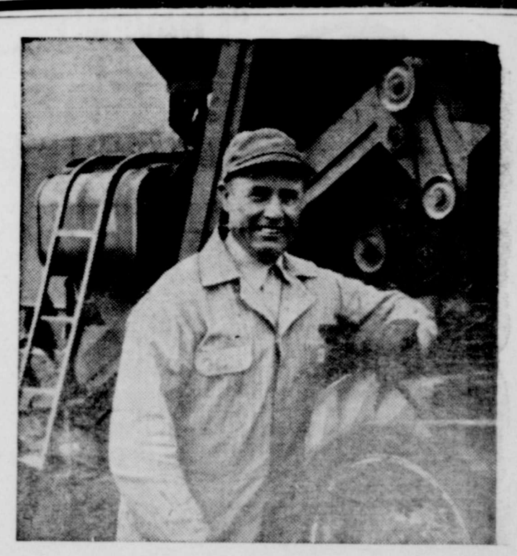
Kress, Tex., Man Reports-