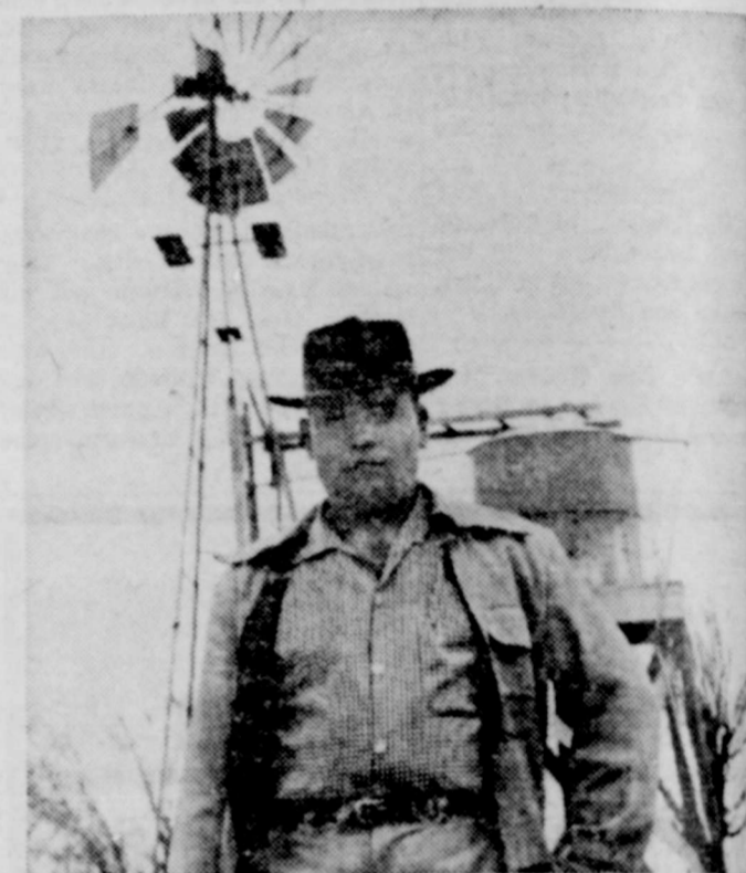
Plainview, Tex., Man Reports—