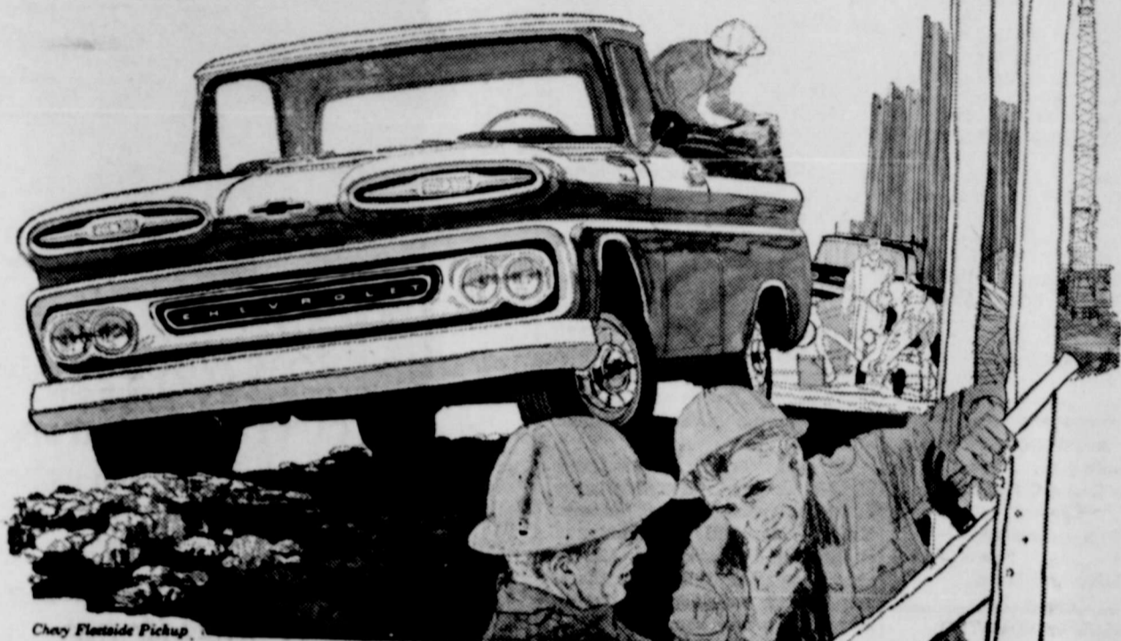
Chevy Flatbed Pickup

You'll get the best buy on the best selling brand at your Chevy dealer's Truck Roundup!