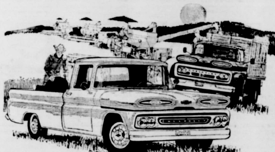
Fleetside Pickup and Series 60 with high rack

SUNDAY Morning Worship 10:30 a.m. Evening Worship 6:00 p.m. WEDNESDAY Evening 7:00 p.m. (Watch space below for special announcement)