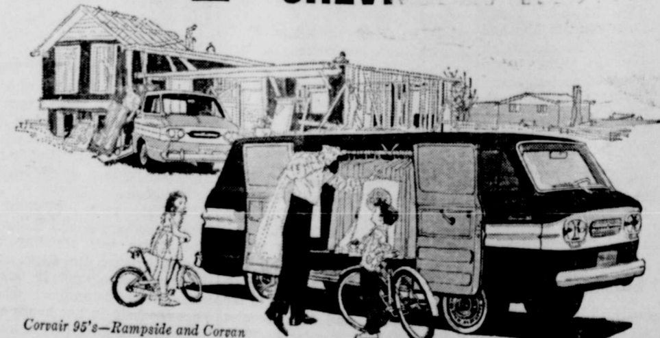
Corvair 95's—Rampside and Corean

See your local authorized Chevrolet dealer