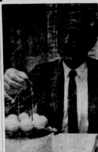
Dr. Gregory Pincus holds tray of eggs before dipping them into solution containing a female sex hormone which will "feminize" an embryonic rooster. He is a March of Dimes research grantee.

If such birds are allowed to hatch and mature without any