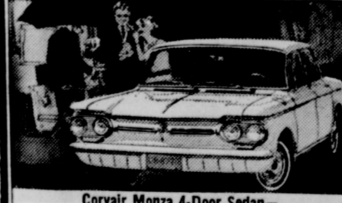
Corvaire Monza 4-Door Sedan—Sports car spice on the family plan.

See your local authorized Chevrolet dealer