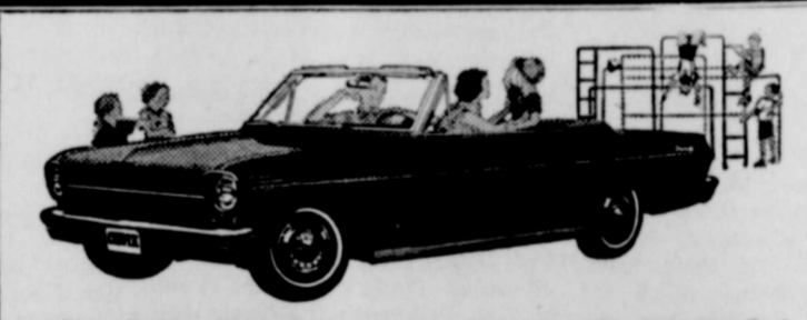
Chevy II Nova Convertible—Thrifty way to get in on top-down traveling!