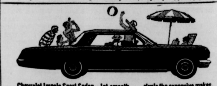
Chevrolet Impala Sport Sedan—Jet-smooth... rivals the expensive makes.