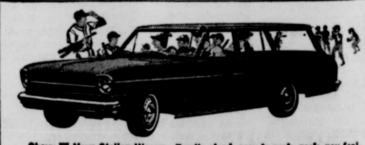
Chevy II Nova Station Wagon—Family-sized, easy to park, pack, pay for!