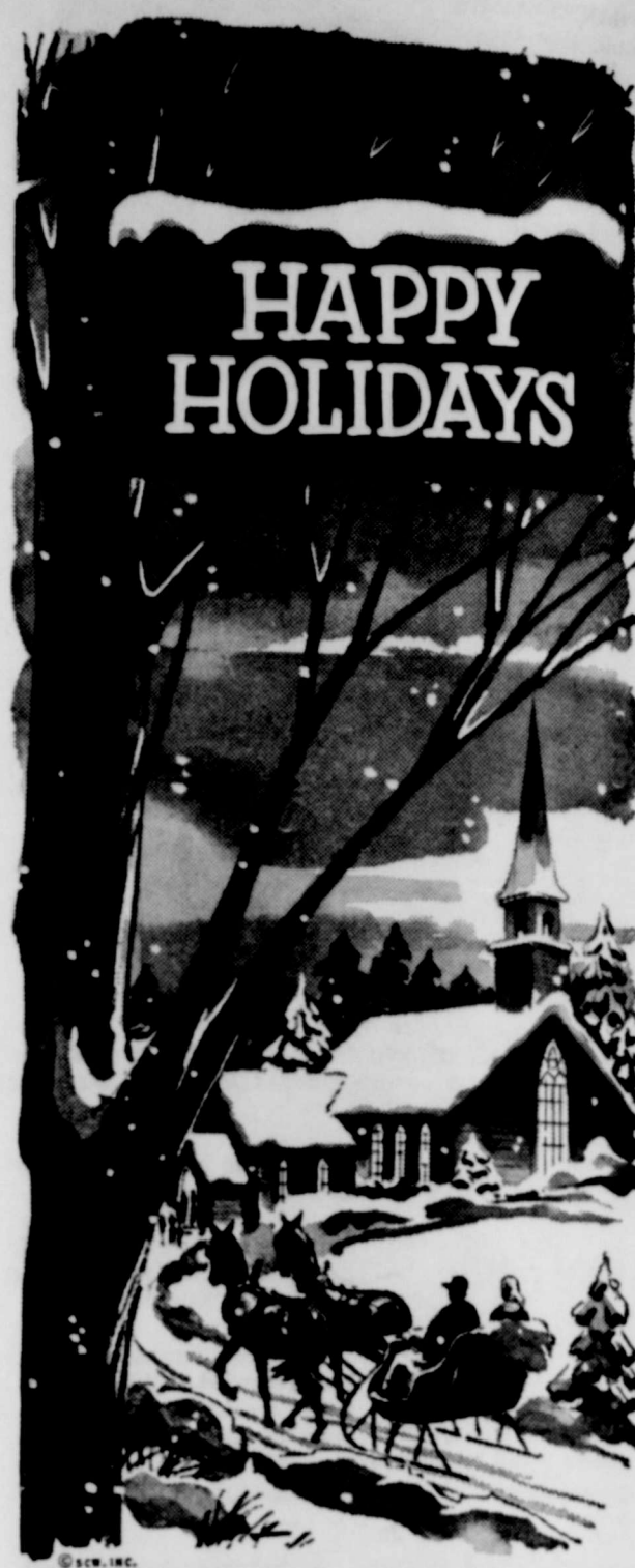
SEASON'S GREETINGS TO YOU AND YOURS.