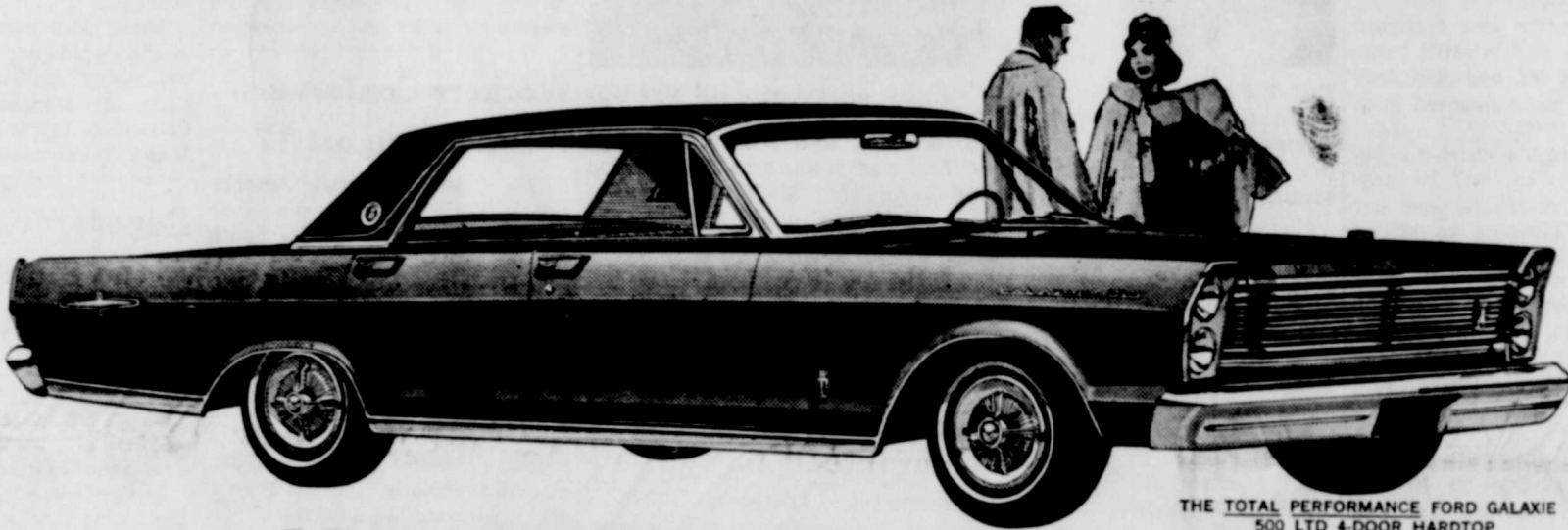
THE TOTAL PERFORMANCE FORD GALAXIE 500 LTD 4-DOOR HARDTOP