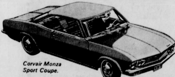
Corvair Monza Sport Coupe.

You couldn't pick a better time than now to buy a Chevrolet! Plenty of beautiful driving weather ahead, and your Chevrolet dealer is making allowances for your old car that are even more beautiful. Come drive a great deal.