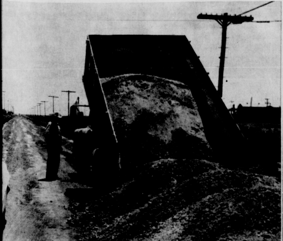
The Brotherhood of the First Baptist Church met on Monday of last week for breakfast, and a work day for the church followed. An all-weather road to the Spanish and Negro missions was the project in which 12 trucks, county road graders and 2 loaders took