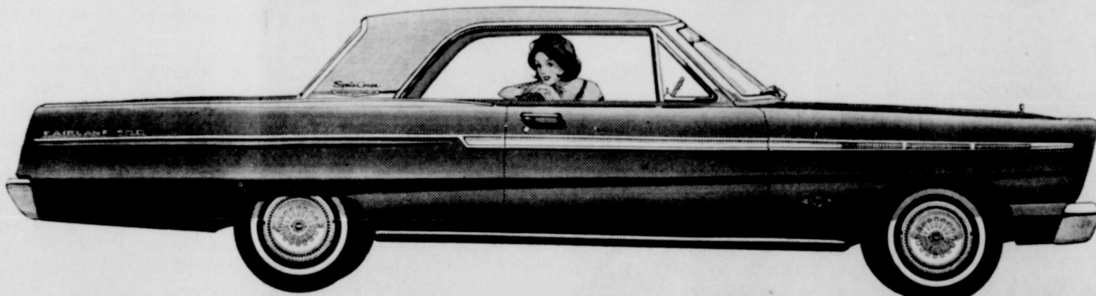
THE TOTAL PERFORMANCE FAIRLANE 500 SPORTS COUPE