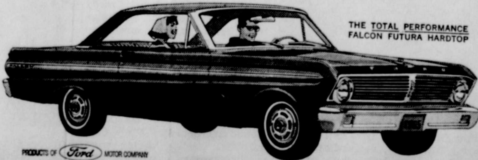
THE TOTAL PERFORMANCE FALCON FUTURA HARDTOP

MUSTANG • FALCON • FAIRLANE • FORD • THUNDERBIRD RIDE WALT DISNEY'S MAGIC SKYWAY AT THE FORD MOTOR COMPANY'S WONDER ROTUNDA—NEW YORK WORLD'S FAIR