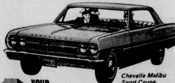
Chevelle Malibu Sport Coupe.

Now's the time to get a No. 1 buy on the No. 1 cars.