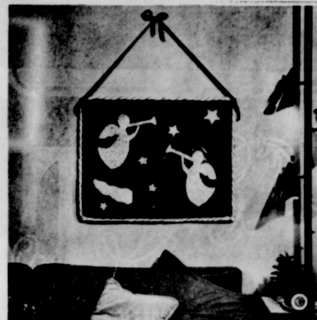
HOLIDAY HANGING —This colorful wall plaque takes only minutes to make. Cover a cardboard rectangle with red cotton corduroy and add holiday motifs cut from glitter-sprinkled cotton batting. The motifs will cling to the fabric without glue. For quick edging, pin on rope of cotton batting entwined with red and green string. Hang to wall with velvet ribbon.