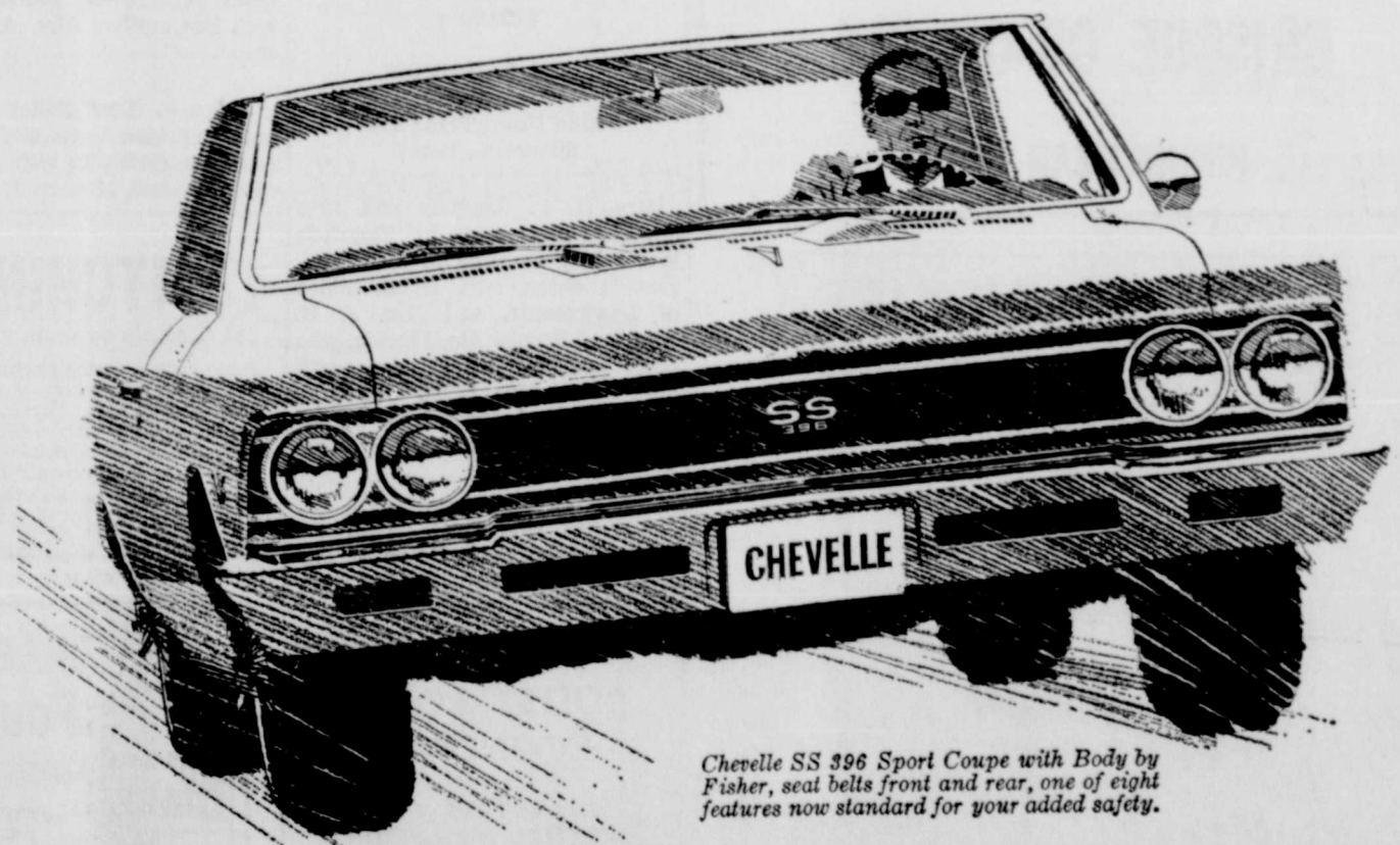
Chevelle SS 396 Sport Coupe with Body by Fisher, seat belts front and rear, one of eight features now standard for your added safety.

For the guy who'd rather drive than fly: Chevelle SS 396