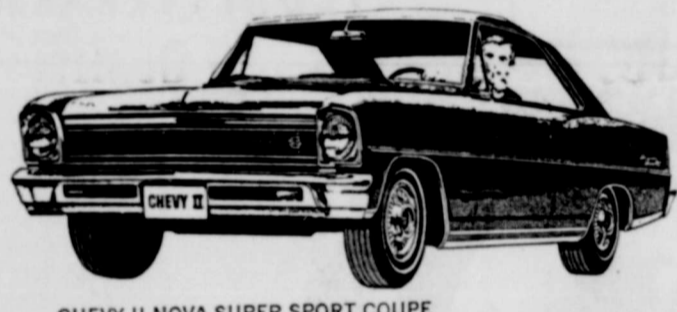
CHEVY II NOVA SUPER SPORT COUPE