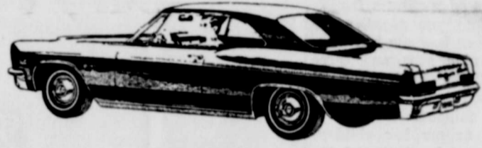
CHEVROLET IMPALA SPORT COUPE