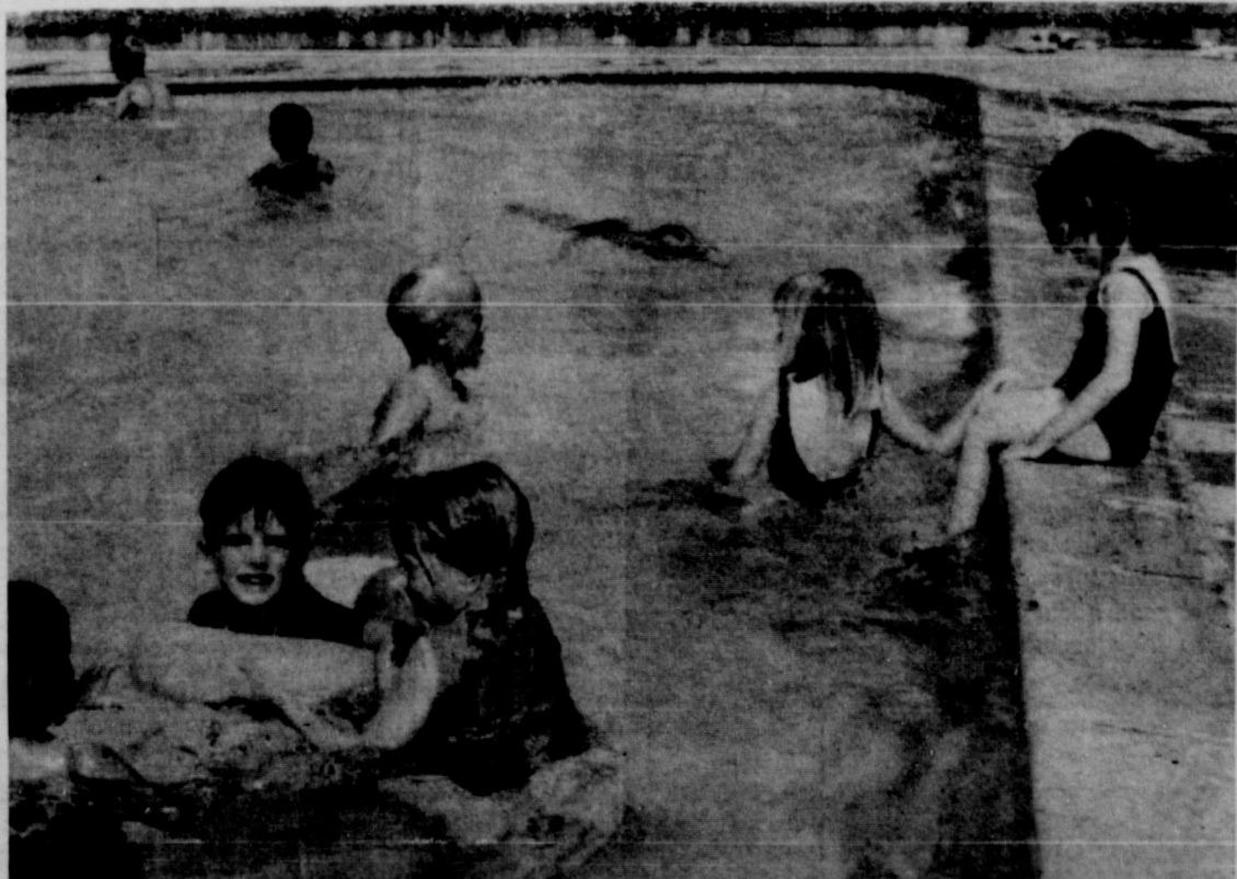
Favorite gathering place of boys and girls play, turning golden brown on a hot spring day. Here a group splash and