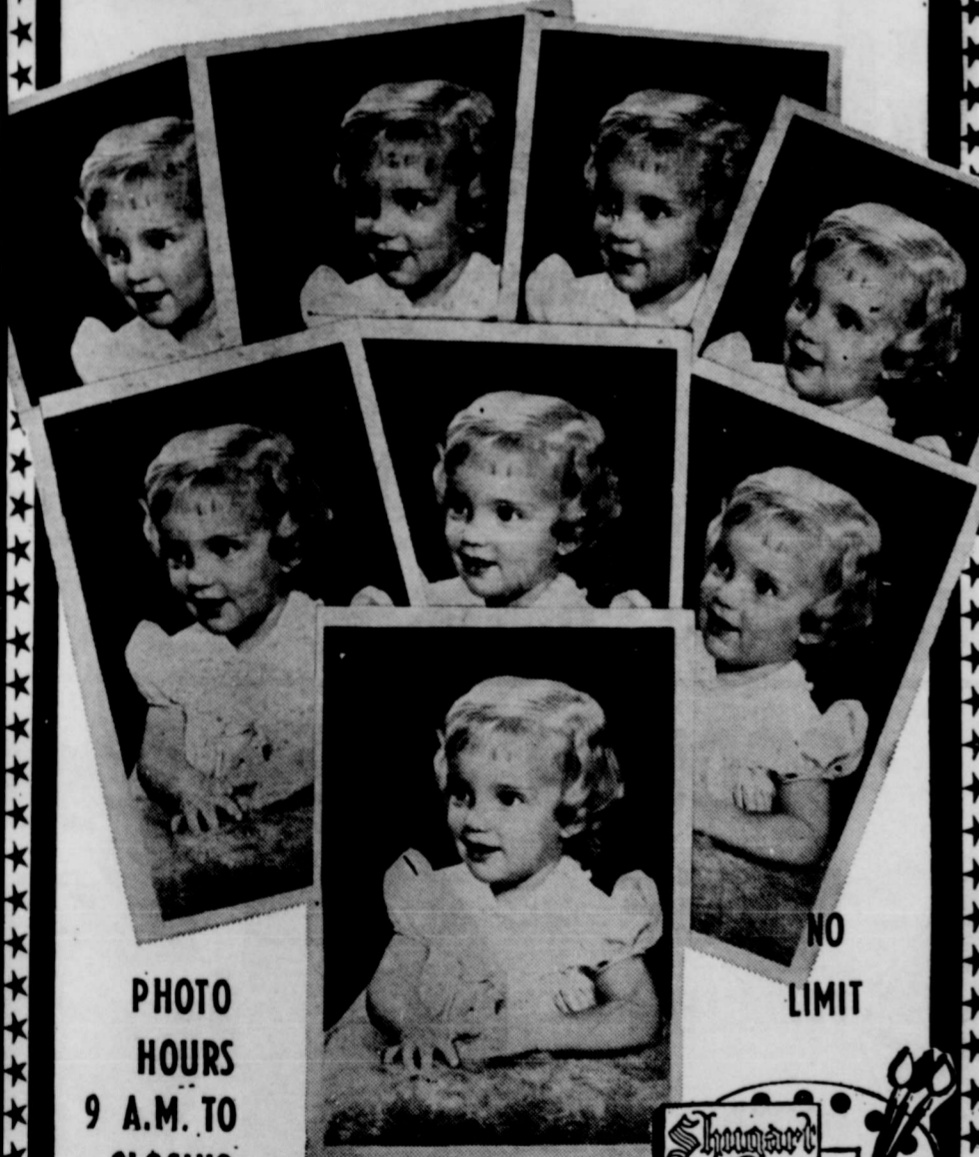
PHOTO HOURS 9 A.M. TO CLOSING

8 99¢ KING SIZE CREATIVE COLOR PORTRAITS FOR ONLY