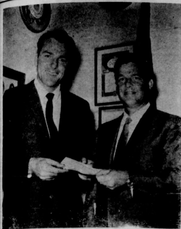
California Congressman Bob Mathias, left, accepts a check from Panhandle Congressman Bob Price to help defray expenses of a group of 41 retarded youngsters to the "Special Olympics" competition in Chicago recently.