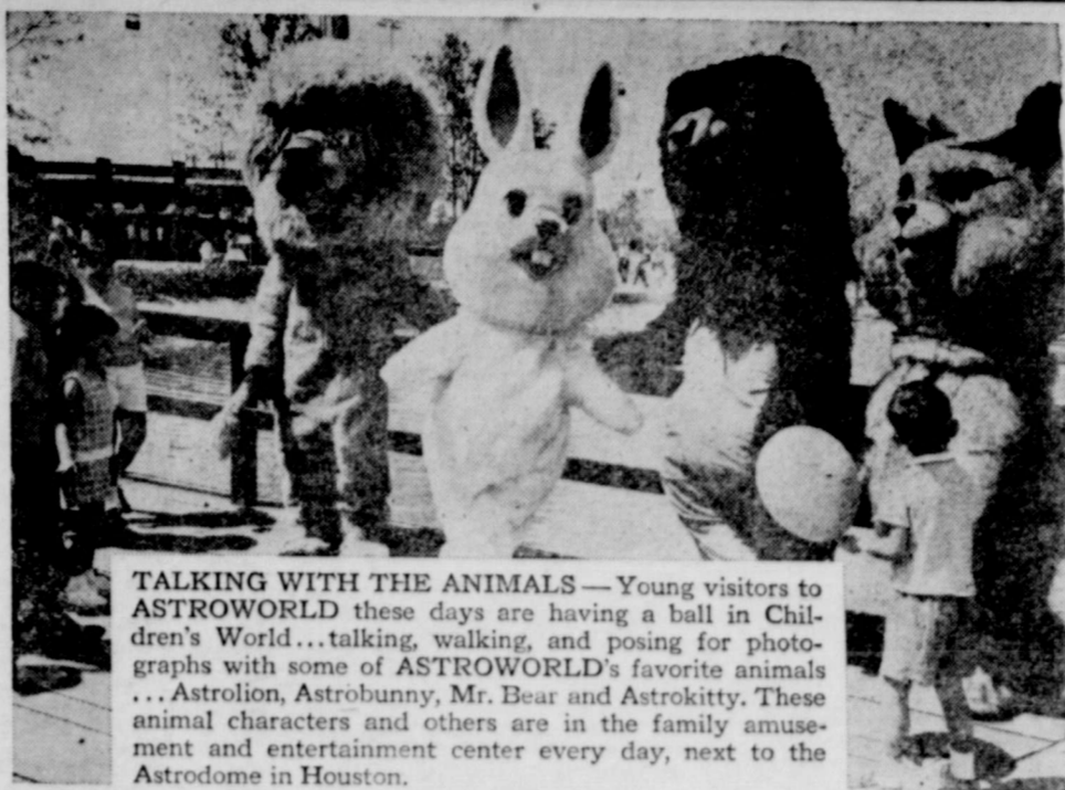
TALKING WITH THE ANIMALS—Young visitors to ASTROWORLD these days are having a ball in Children's World...talking, walking, and posing for photographs with some of ASTROWORLD's favorite animals...