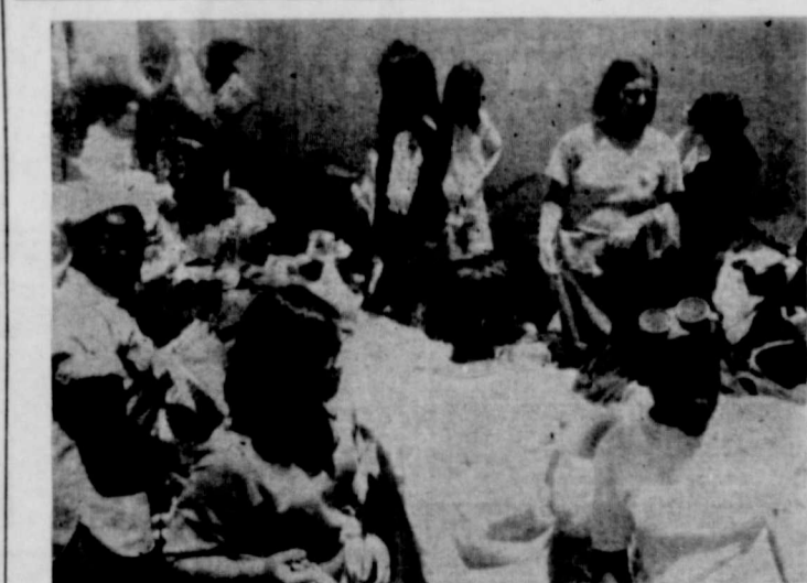
Some of the girls who live at Girlstown U.S.A. are shown going through boxes of clothing, some of which were given by their friends in Silverton. Each of the girls goes through the clothing donated and picks out what she needs and wants for herself.