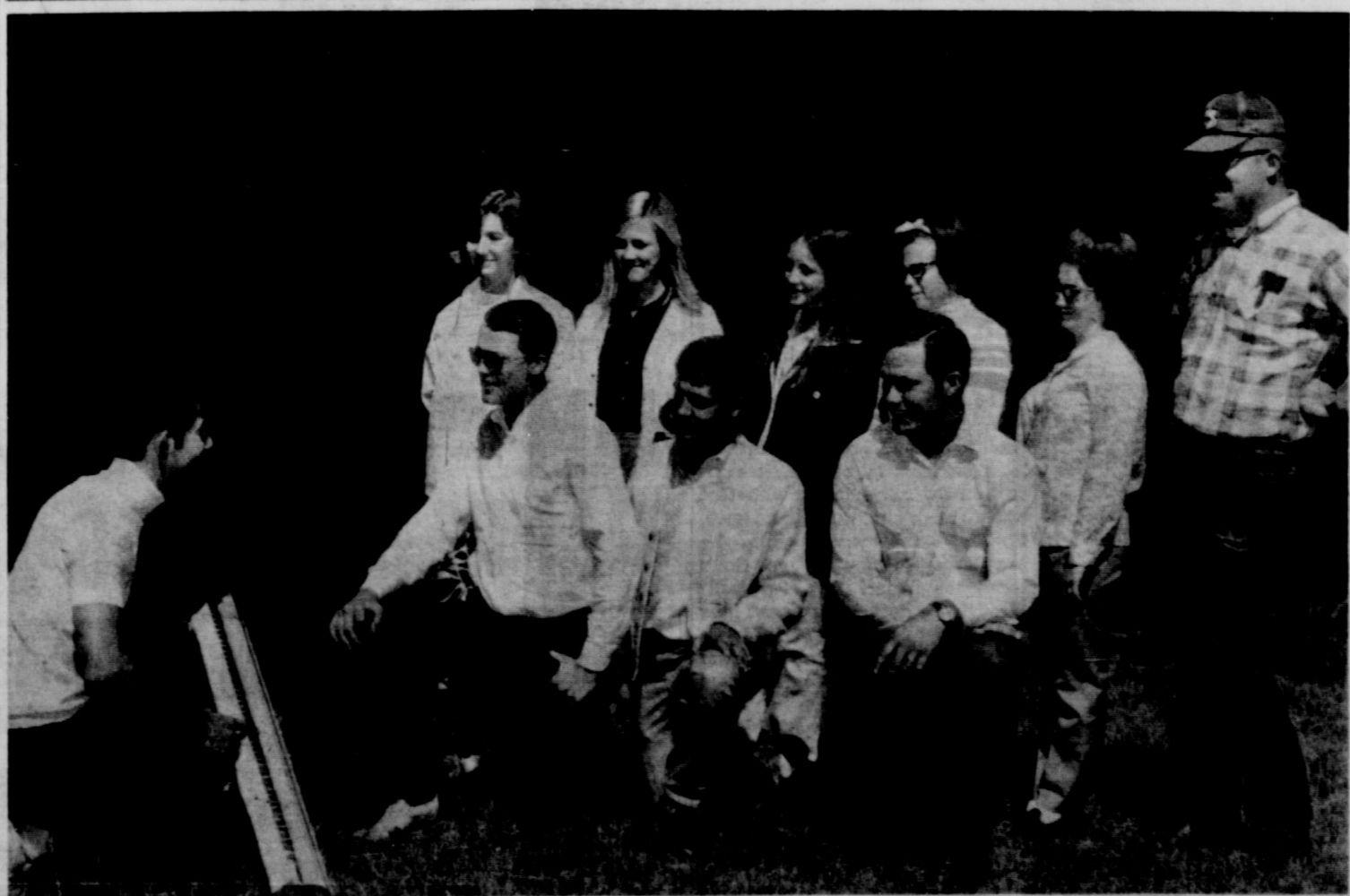
High in the Sacramento mountains of New Mexico, 4-H Club members from Briscoe County are learning the basics of electricity while attending the 4-H Electric Camp, sponsored by Southwestern Public Service Company. Shown left