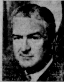
John B. Connally