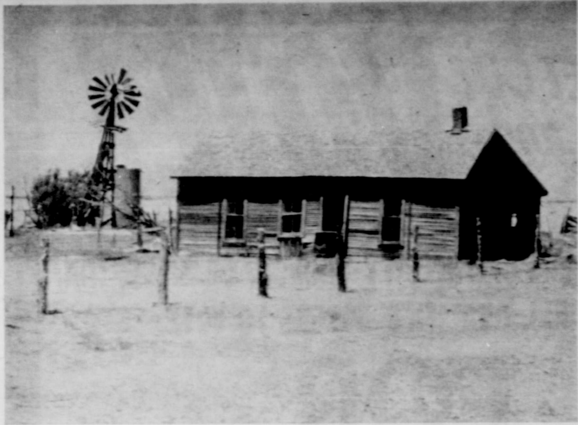
The old pictured above is located at the approximate site of the proposed Mackenzie Municipal Water Authority filtration plant, north of the Rock Creek Store. The four area towns comprising the Authority will vote September 6 on whether to construct the dam which would impound a lake to provide municipal water for Tulia, Lockney, Silverton and Floydada.