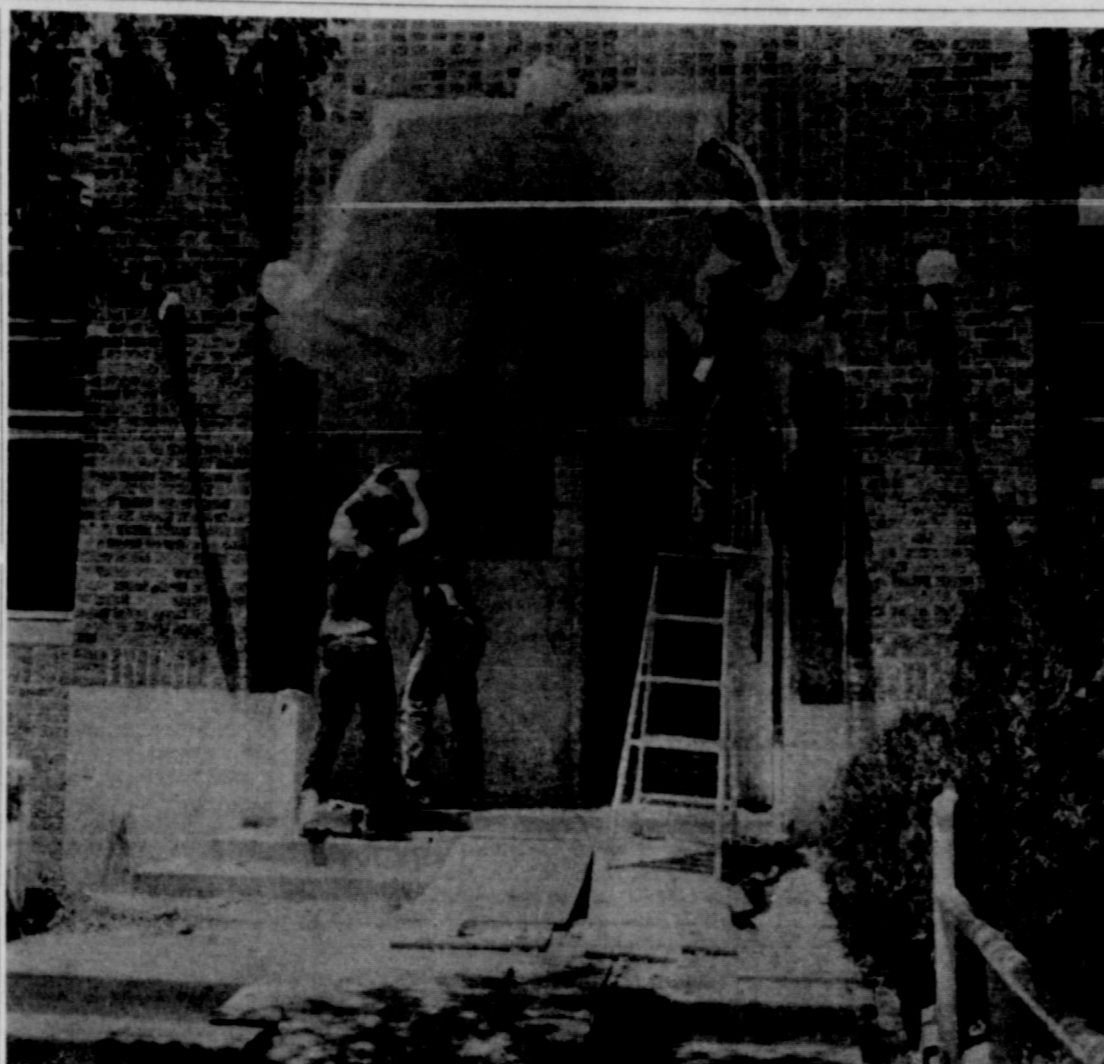
Workmen were pictured last week as they exterior while a total remodeling is more than half completed inside. Workmen foresee New Aluminum-frame windows have added no problems and expect to be finished with a fresh new appearance to the building's the remodeling before school starts.