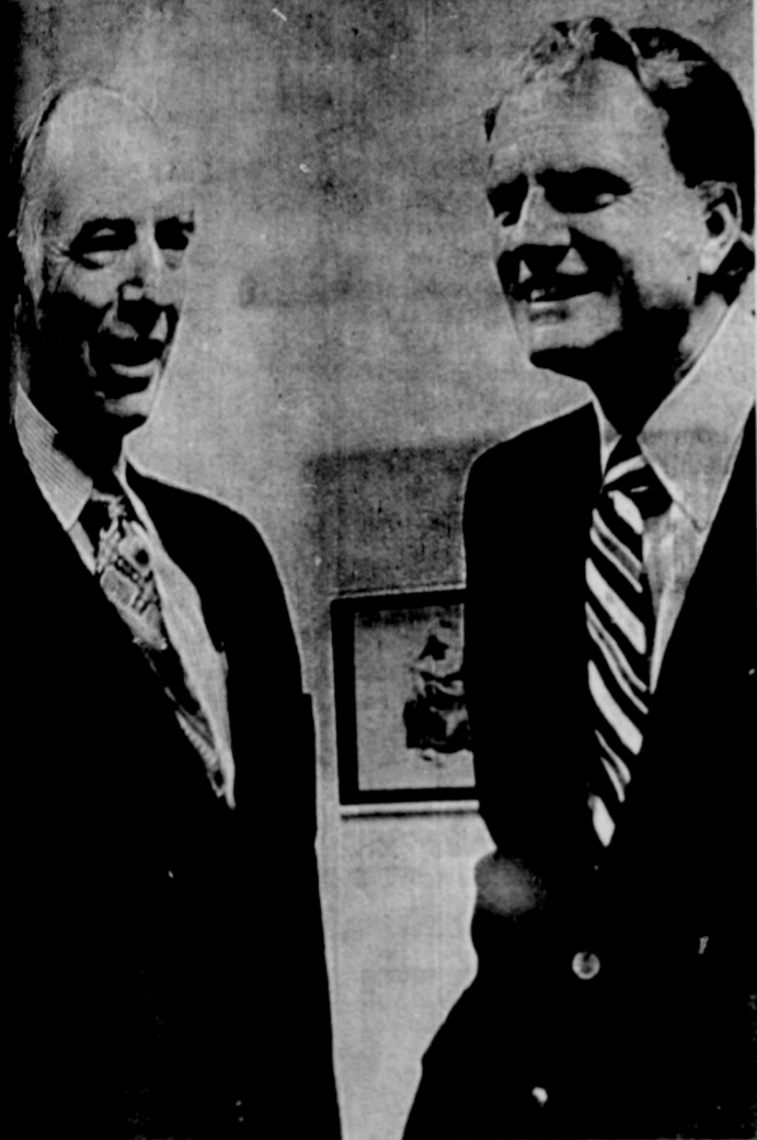
Congressman Graham Purcell from the 13th Congressional District, Texas, was a guest on the platform for the invocation of the Greater Southwest Billy Graham Crusade on Sunday, September 19, 1971. The Crusade was held at the new Texas Stadium in Irving.