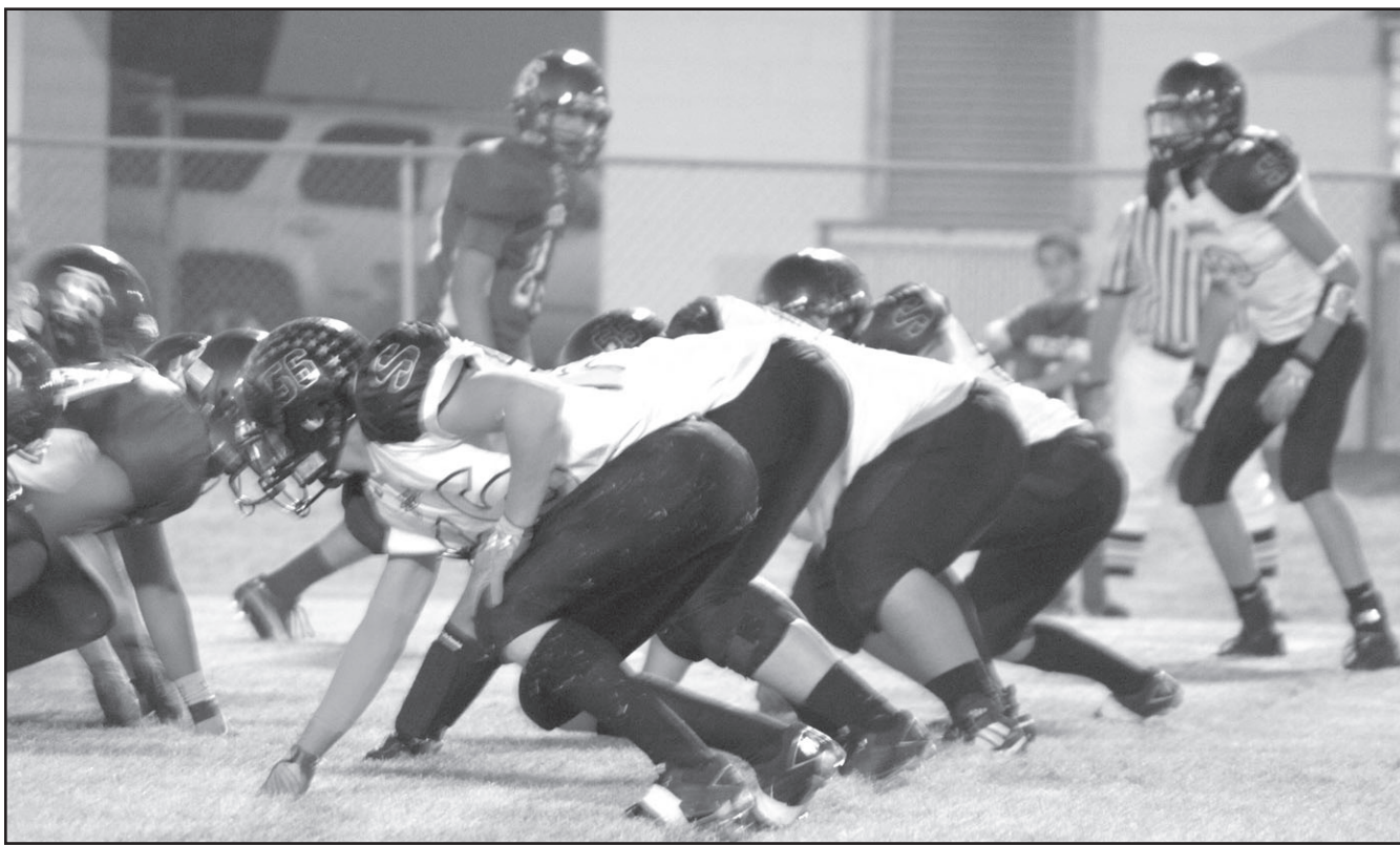
The Hornets line up against the Farwell Steers.

in a good performance for the special teams. He punted the ball twice for an average distance of 35 yards. The Hornets will continue their district play against Springlake-Earth on Friday, Oct. 22, at 7:30 p.m., in Sudan. The team stands 1-1 in district play.