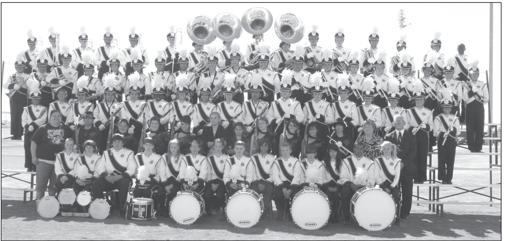
Sudan's award winning "Bold Gold Band"