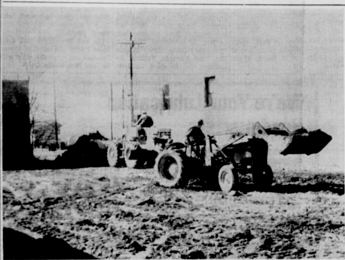
Work got underway in downtown Silverton last week on one part of the eight-point beautification program. The Young Farmers brought in some heavy equipment and with some assistance from the City, dug out an old foundation and levelled the lot between Hunt's Barber Shop and the Pool Hall where a mini-park will be built.