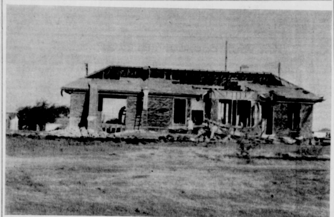
The old Fort Worth & Denver Railroad Station in Silverton is being torn down. Built in 1928, when the rail spur was a vital tran-

sportation link for this area, the razing of the Colleges for his 91.38 scholastic avbuilding erases a familiar landmark from the erage.