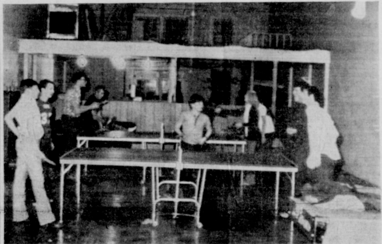
Action at the CETA Hut—Newly opened, but already popular with the young people, is the CETA Hut, a youth center started recently in a vacant building in downtown Silvertown by the First Baptist Church.

come to see them. Please don't disappoint us this time. Come to see 'Suitable For Hanging' and get back into the habit of supporting our school. Thank you, Seniors '74."