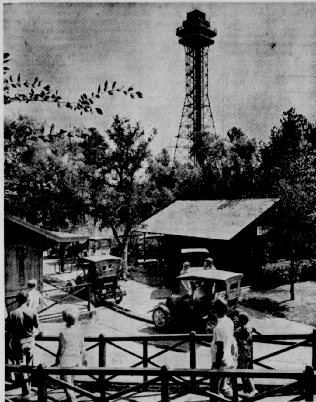
HISTORY CAN BE FUN — Miniature antique cars provide a "ride into the past" for visitors to Six Flags Over Texas. In the background is the Arlington theme park's landmark Oil Derrick. From observation platforms atop the 300-foot tower, guests can see the skylines of both Dallas and Fort Worth.