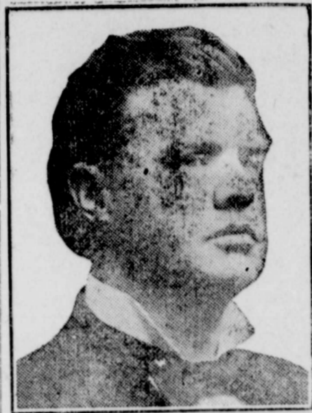
Jno. W. Woods

Hon. Jno. W. Woods, representing the 121st District in the Lower House, has introduced a bill providing for compulsory education of children between the ages of 8 and 14 years. The legislature is giving preferred attention to educational matters and some of the strongest members of the legislature are on the committees dealing with education subjects.