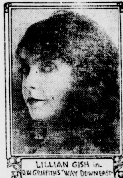
LILLIAN GISH in "WAY DOWN EAST"