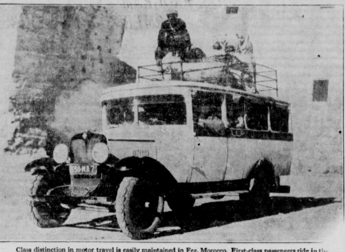
Class distinction in motor travel is easily maintained in Fez, Morocco. First-class passengers ride in the valf of this Chevrolet bus, second-class in the rear half, while third-class find accommodations on the roof.