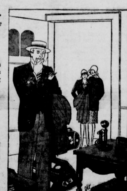
"Something should be done about this"

facation sees are available for periods of more than 30 days, but not over four months. They apply only to residence