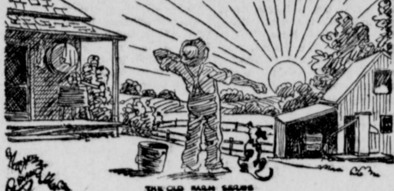
THE OLD MAN SEEMS

When I tire of this up-to-date frenzy With its clashing and clamorous blaze; When I'm weary of pushing and rushing, And of life with its windows a-glare; Then I quietly wander in fancy Back again to the farm where I knew The deep peace of the sunrise and sunset, And the cornfields that glittered with dew.