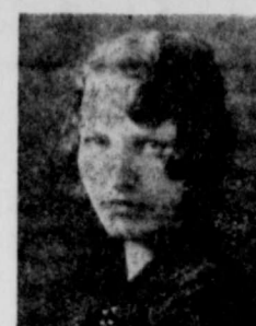
H. E. TEACHER