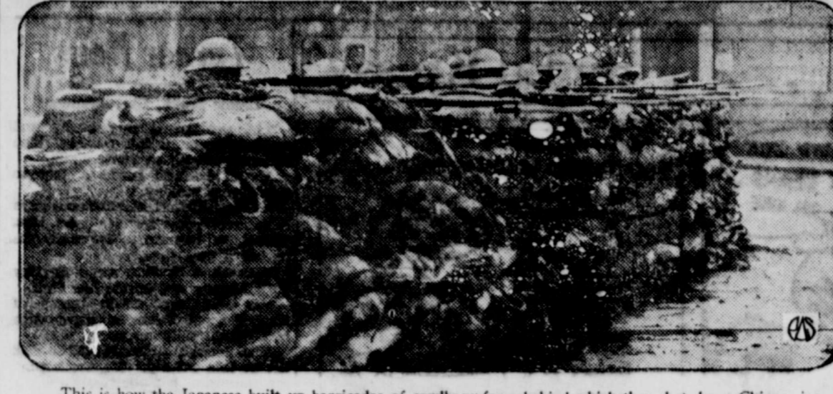
This is how the Japanese built up barricades of sandbags from behind which they shot down Chinese irregulars and civilians while the residents of the Foreign Colony looked on helplessly to interfere.