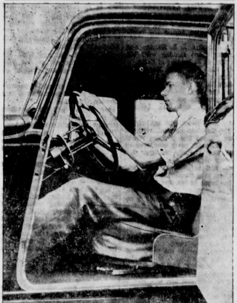
The special apparatus illustrated above was used during the "auto fatigue" researches conducted by the famous physiologist, Dr. Andrew H. Ryan of Chicago, to determine the number of movements of the steering wheel made by a driver in the course of a day's run. This test was one of a number through which the amount of mental, nervous and muscular energy required for the operation and control of different automobiles was measured. A 300-mile drive will require 10,000 to 30,000 oscillations or movements of the steering wheel, depending on the nature of the road and traffic. The test car illustrated above is a Dodge.