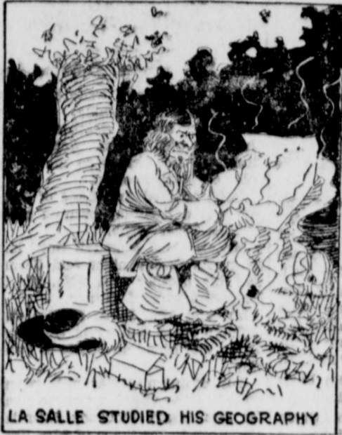
LA SALLE STUDIED HIS GEOGRAPHY