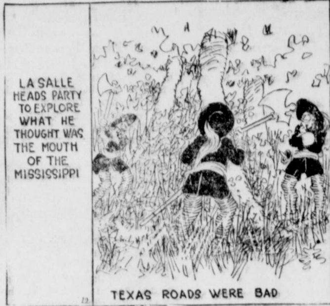
TEXAS ROADS WERE BAD