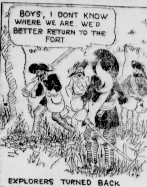
EXPLORERS TURNED BACK