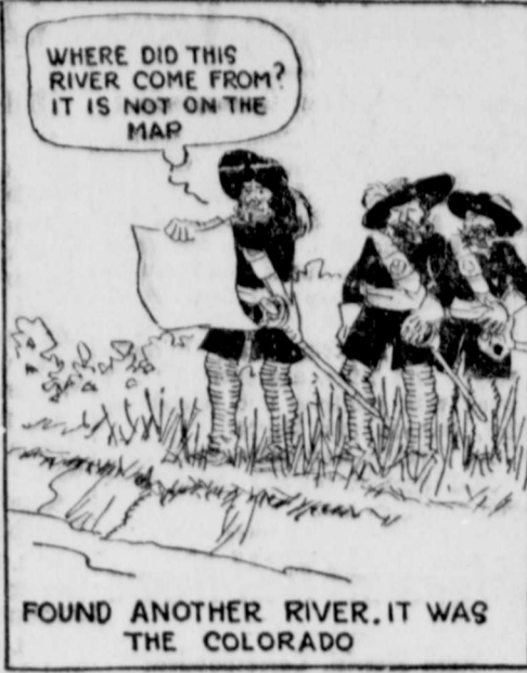
FOUND ANOTHER RIVER, IT WAS THE COLORADO