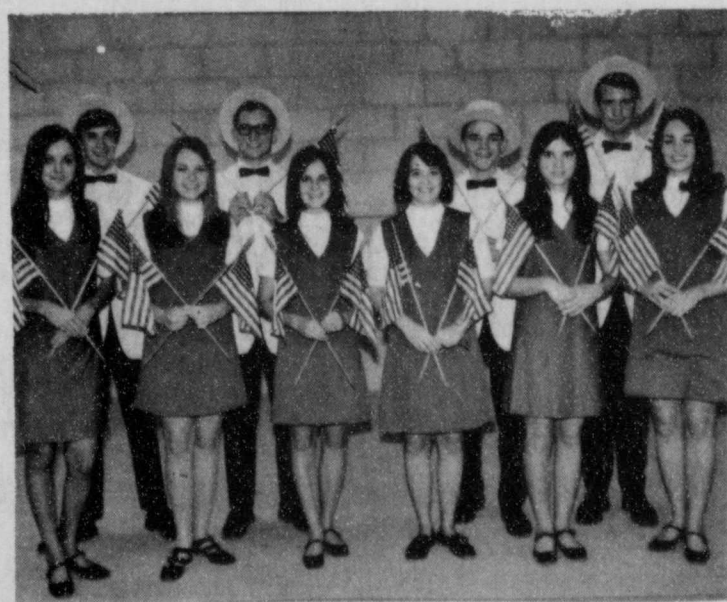
SNYDER HIGH SCHOOL CHOIR

Don't forget when you to buy your Christmas tree, the Roby Fire Department is selling them and they are located at the Legion Hall. The proceeds from the trees go to buy more lights to recondition the ones they have and to buy more so the court house can be better lighted.