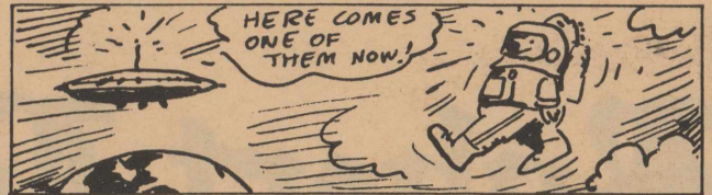
The first American to "walk" in space was Edward H. White. He did so in June 1965.

Those who complete course and pass Health Dept. exam will be certified to work on ambulances anywhere in the State of Texas.