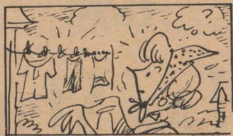
In old Germany it was illegal to tie nine knots in anything

At lunch time the students took tin pails containing their lunches and ate outside under the trees. After their Fort Concho School day was over, the fourth graders went on a tour through the museum.