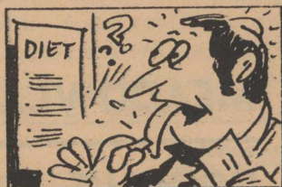
According to the U.S. Post Office, the glue on a stamp contains one-tenth of a calorie.