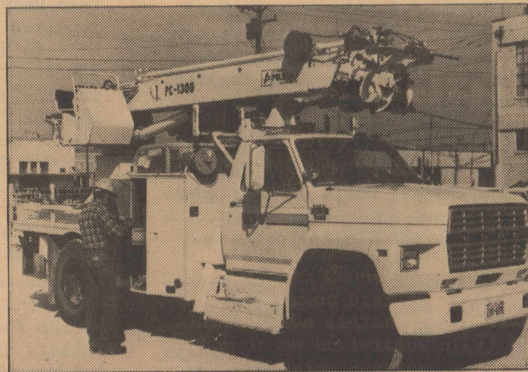
WTU digger-derrick truck