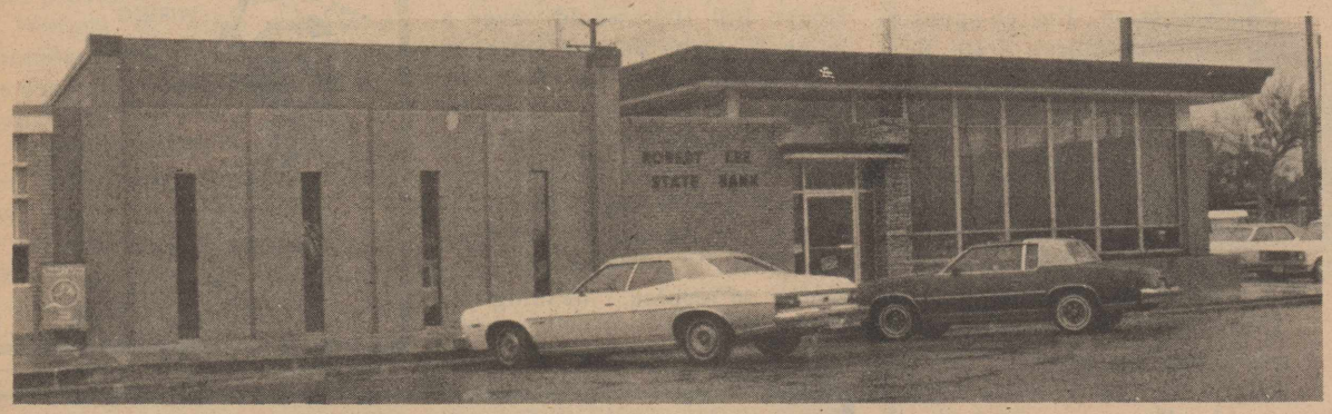
ROBERT LEE STATE BANK-- NEW SECTION ON LEFT