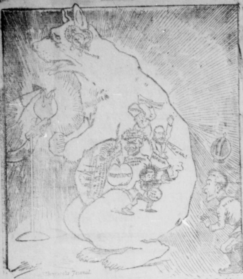
If the Good Would But Take a Good Look at Russia's Little Inside.