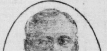
GEN. STEPHEN D. LEE

NEW ORLEANS, MARCH 14.—An official proclamation has been issued by Gen. Stephen D. Lee, commander-in-chief of the United Confederate Veterans.