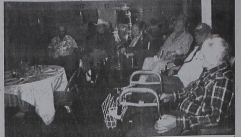
Veterans who live at Eastland Healthcare Center attending the POW-MIA ceremony, conducted by the Ladies Auxiliary and Veterans of Post 4136.

also studied Law at home, passed the State Bar exam, and became a practicing Attorney.