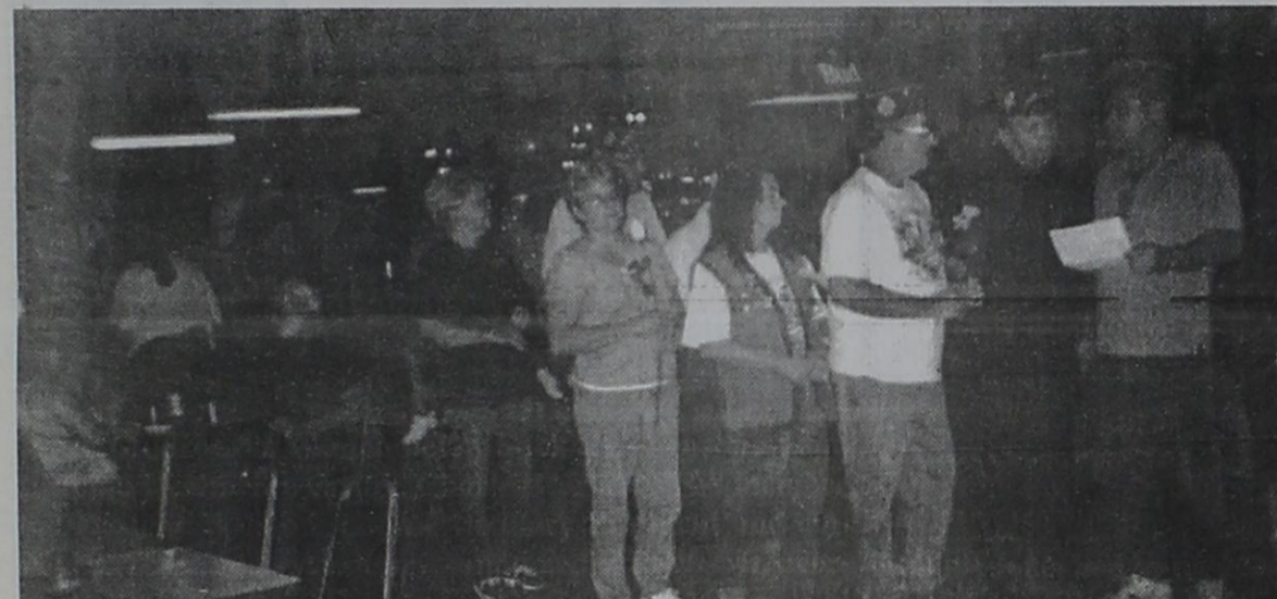
Members of the VFW Post 4136 and the Ladies Auxiliary during the POW-MIA ceremony at the Post.