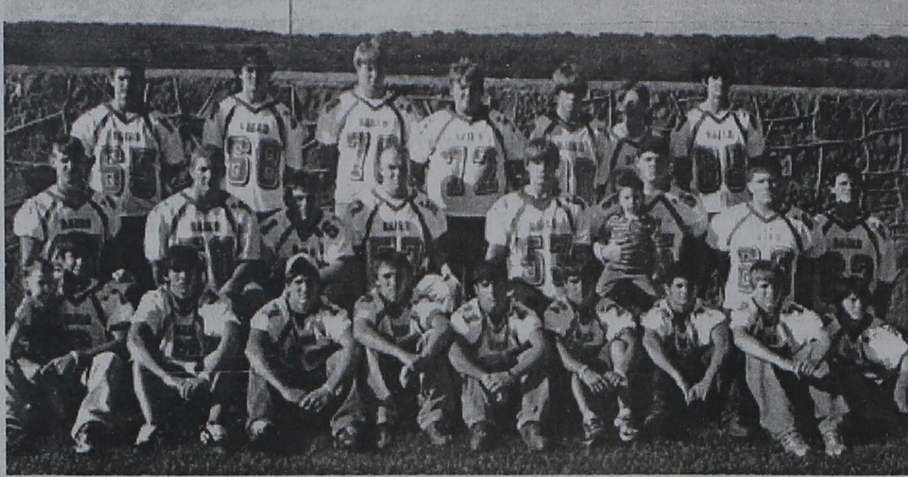
BAIRD BEARS Varsity Football Team