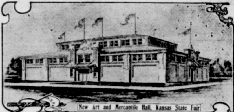
New Art and Mercantile Hall, Kansas State Fair

The day of the wooden structures that have characterized the Fair grounds at Topeka is past, and the aim of the management to replace these with permanent structures of