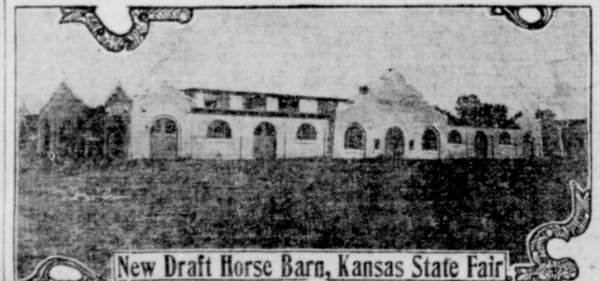
New Draft Horse Barn, Kansas State Fair

ways and gates, that will command the admiration of the visitor and be a beacon light of welcome to the stranger within our capital city. This imposing gateway is permanently built