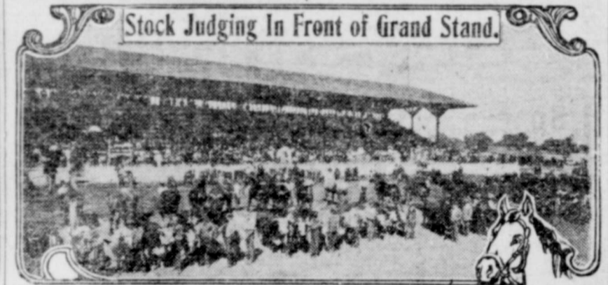
Stock Judging In Front of Grand Stand.

ways and gates, that will command the admiration of the visitor and be a beacon light of welcome to the stranger within our capital city. This imposing gateway is permanently built