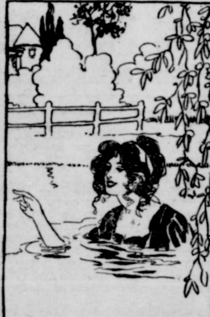
A Wet Brown Head Was Shaking Up From the Water!

It seemed ages to the others before the man's head again appeared, and his strong arms pushed the girl before him and up into the arms of Selby, who had run up from a little distance, and stripped off coat and shoes, making ready to follow Smith.