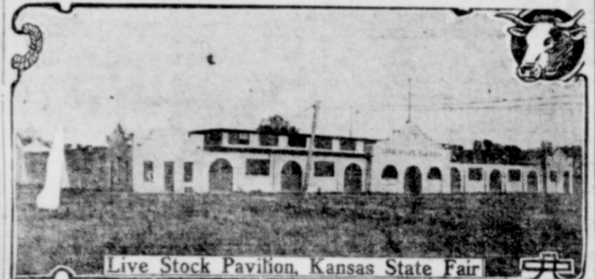
Live Stock Pavilion, Kansas State Fair

into fine buildings inside the grounds was considered passe by the State Fair management, and they have had erected at considerable cost a massive and stately entrance, arched over drive-