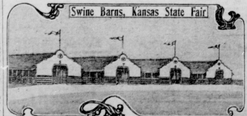
Swine Barns, Kansas State Fair

As rapidly as its finances will permit and as regularly as the work can be completed other improvements will